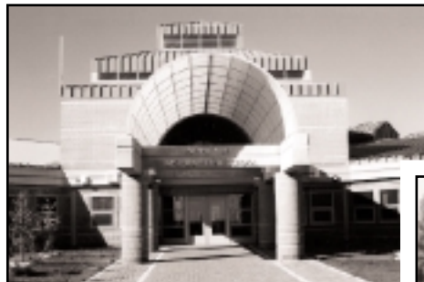
Father Porte Memorial Dene School, Black Lake

Two applicants also received a $1,000 developmental grant to develop their proposals more fully for the next round of applications.