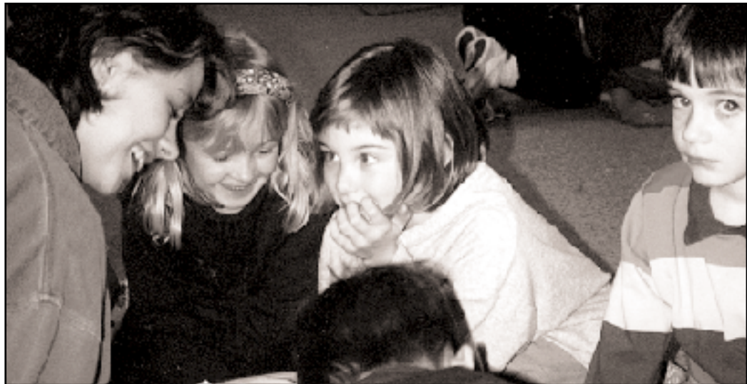
Children and a student teacher at St. Matthew School in Regina plan an activity as part of a school naturalization project partially funded by the McDowell Foundation, called Welcoming Back the Wilderness .