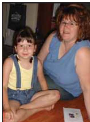
Young students and their parents learn math together as part of a McDowell research project at St. Francis Community School, Regina on Utilizing Photobooks to Increase Family Involvement in the Learning/Teaching of Mathematics.

An overview of the Foundation’s research awards over the past five years is provided in Table 2. The Foundation has now offered over one million dollars in research grants. However, recently there has been a noticeable drop in the number of applications for funding, and last year the Foundation did not spend the full amount that it has available to support research projects.